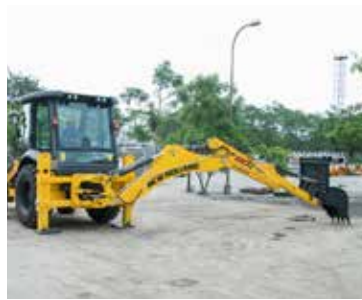
A RELIABLE BACKHOE