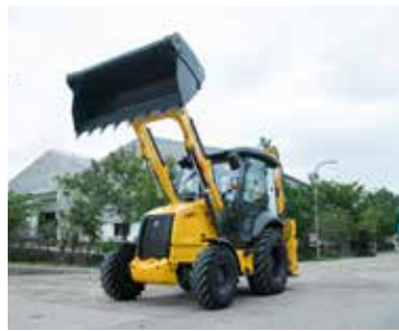
AN EFFECTIVE LOADER