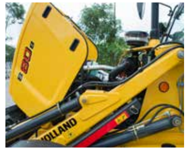
EASY MAINTENANCE ACCESS