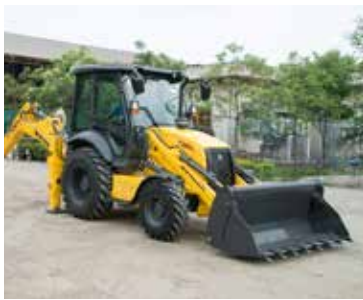
COMFORT AND SAFETY